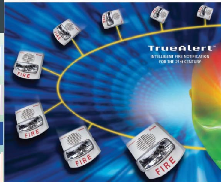
Simplex Fire Alarm System