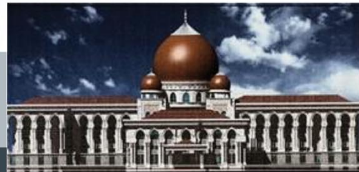
Metronic developed and installed a state-of-the-art security and IBMS system for the Palace of Justice in Putrajaya which integrates fire alarm, lift and voice communication systems into a unified building management system